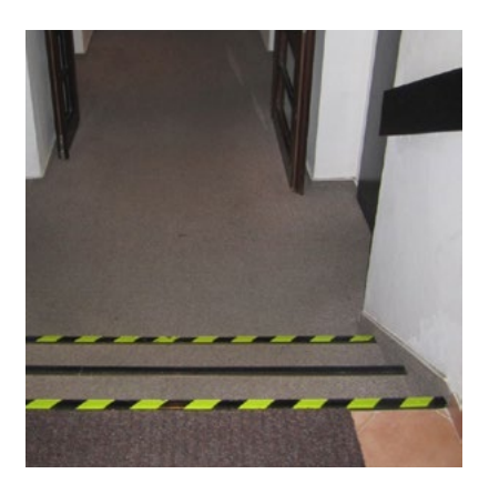
an obstacle in the form of uneven floor level hindering movement in wheelchair