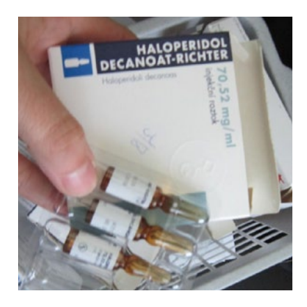
"common for all" medicine Haloperidol