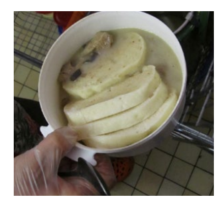
food served in degrading plastic bowls

The situation is especially serious when persons with dementia are concerned, since they have specific nutritional needs.<sup>3</sup> Foods were not adjusted to their needs – they were not varied and nutritious enough and on certain occasions there was not even enough food. Foods provided to diabetics were not suitable to their needs. In one of the facilities,