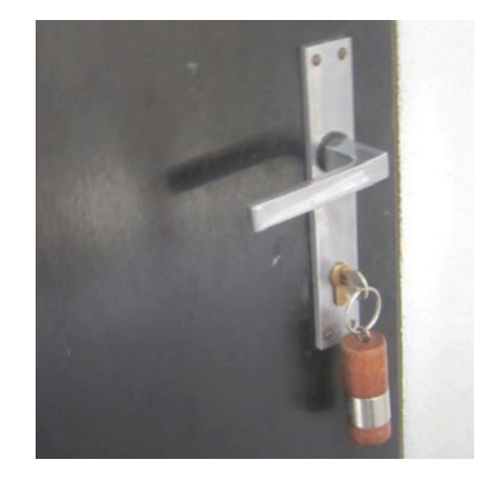
room with clients locked from outside