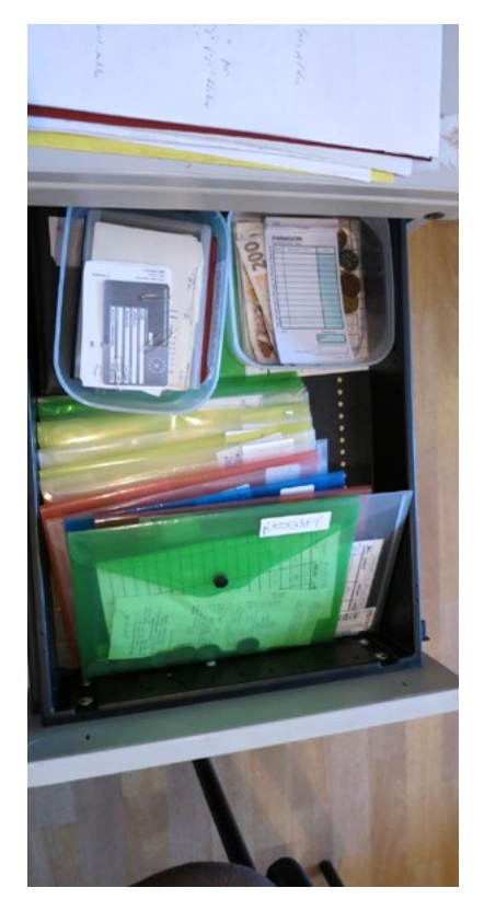
personal documents stored in an unlocked drawer

One of the problems monitored during the visits was the privacy of clients. Exchange of incontinence aids and assistance with hygienic activities in the presence of other persons without using screens was a frequent violation. It is unacceptable to let a client be watched by others when receiving delicate care. A frequent problem was a lack of privacy in using sanitary conveniences (shower, toilet) because the doors were not lockable or provided with signals showing that the room is occupied (for example, a scutcheon). In this arrangement, anyone could enter and see the client undressed.