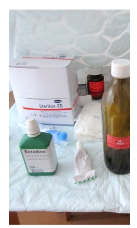
storage of medical products, including products for treatment of decubitus ulcers, in the rooms with a bedridden client

Nursing care is a form of health care under Section 5 (2)(g) of Act No. 372/2011 Coll., on healthcare services and the conditions for their provision, as amended, which may be performed by a registered provider of health or social services, through persons qualified to perform a medical profession or to perform activities associated with the provision of healthcare services [Section 11 of the Healthcare Services Act]. Pursuant