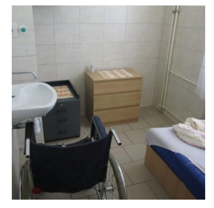
a client's room (walls are tiled)