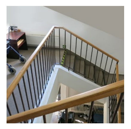
staircase over which some clients were moved manually