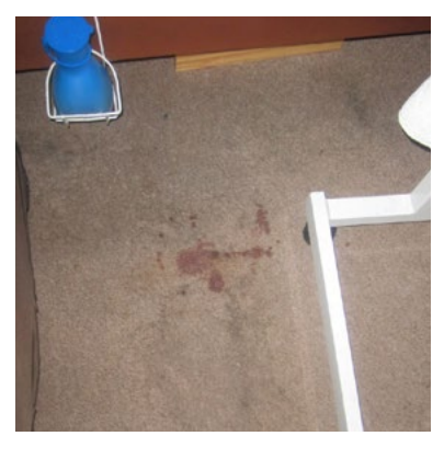
insufficient hygienic conditions in a client's room

"picture" made of faeces on the wall next to a client's bed