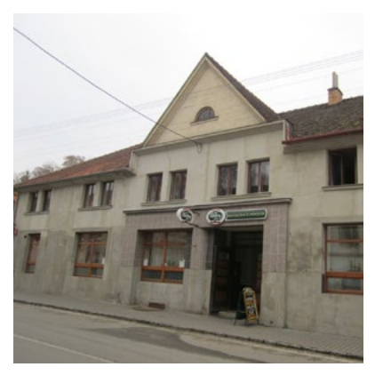
buildings of two of the facilities visited