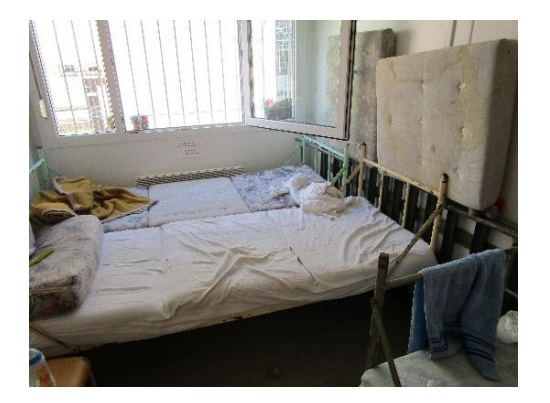
Figure 23 Figure 24