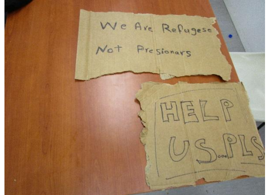
Figure 10 Figure 11

There was a lot of tension in this part of the Facility. The foreigners' frustration from the living conditions, the lack of understanding of the purpose of detention, uncertainty concerning the duration of detention, rumours and treatment of them were reflected in their resignation or, on the contrary, active appeals for justice. Tensions were further heightened by the iron mesh covering their entire outing area as well as the generally constrained area with no view of anything but the walls of the container units, the forest and uniformed personnel. These people saw themselves as "caged animals".