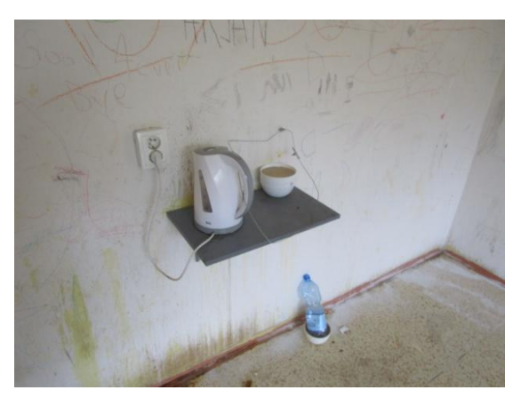
Figure 32 Figure 33