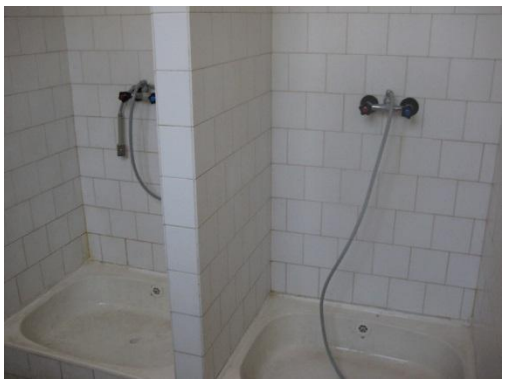
Figure 19 Figure 20

Conditions found: People housed in this area (usually for 2 –11 days) received only bread and cheese three times a day; received no personal hygiene package on admission; had no direct access to the toilet and running water (in order to get to the toilet they had to knock on the door and wait for a private security guard to arrive); could not access a telephone and were thus unable to contact relatives, despite being issued with a telephone card by the Refugee Facilities Administration; could not store food in a refrigerator. No regular cleaning of the gym was carried out (as witnessed by a detainee placed in the gym for 11 days). A number of people attested to the fact that they had no outings and were thus, in fact, not allowed out of the gym at all.