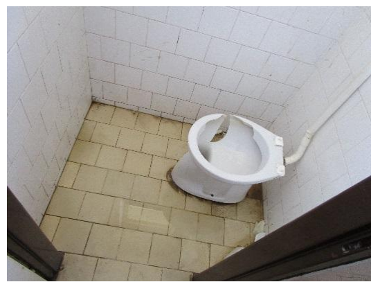
Figure 21 Figure 22