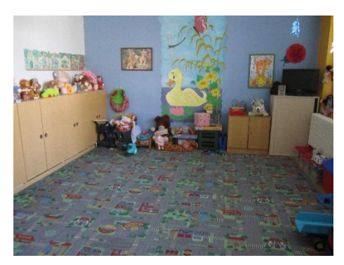
Figure 3 Figure 4

Children housed in Building A were provided with a common room (also a playground), which was open for use for 2 hours a day. When the reserved time ran out, activities for children were stopped. Children housed in the container units near the administrative building (approx. 50 children) were