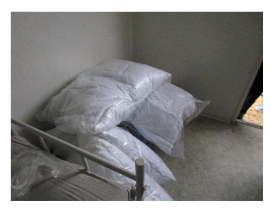
Figure 13 Figure 14

Interviews with the detainees revealed the following: